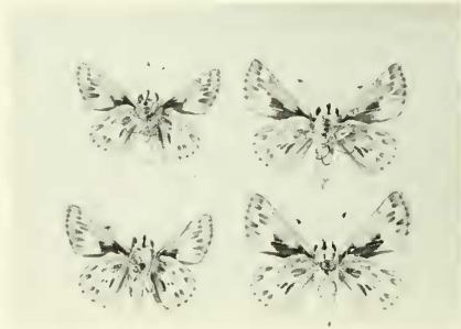
Fig. 4. Dorsal and ventral surfaces of representative bred Polites sabuleti sabuleti ; continuous light, 25C.